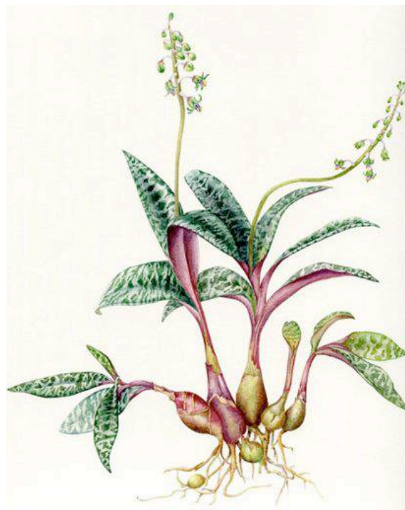
Ledebouria socialis