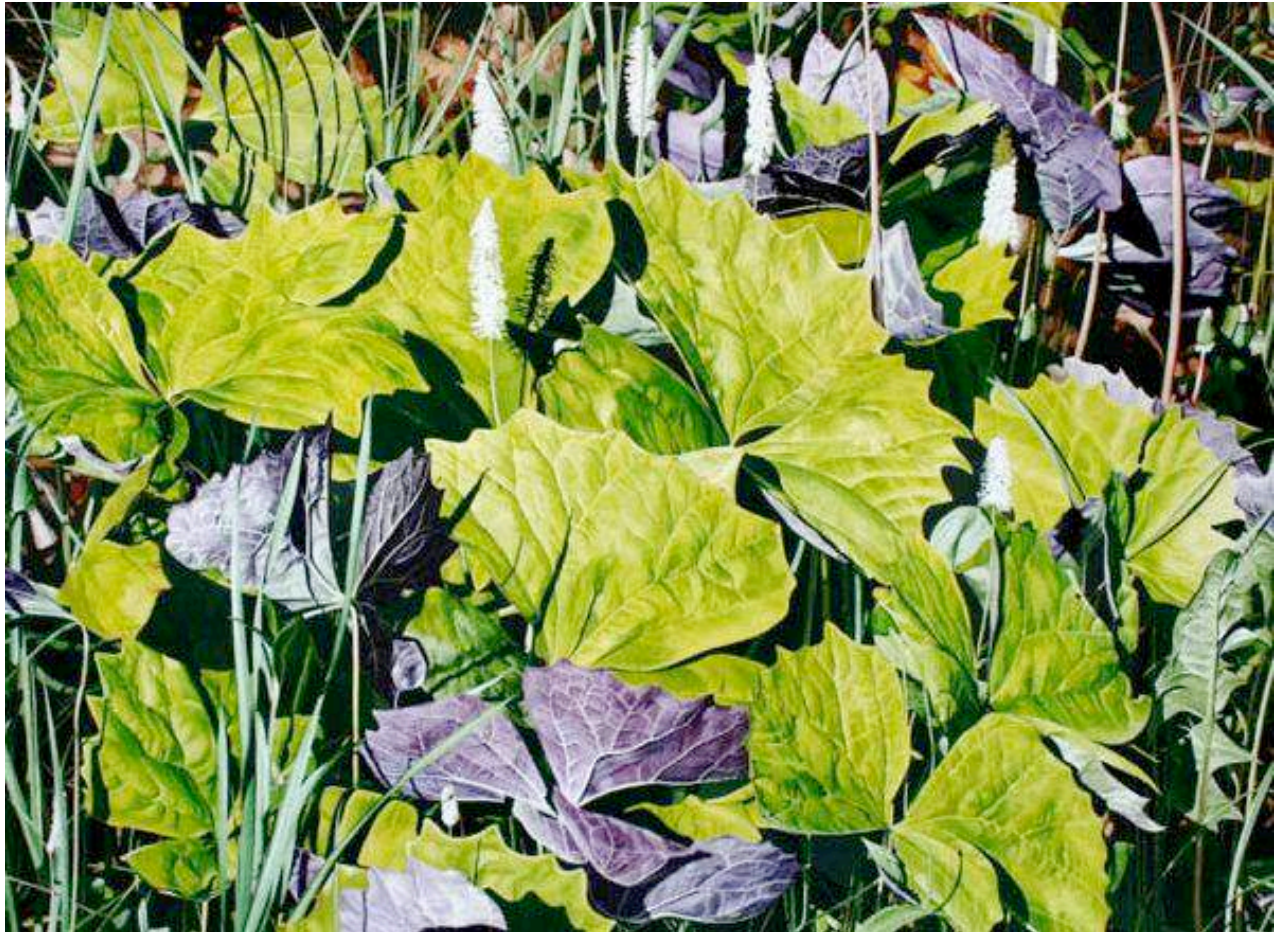
Achlys triphylla : Vanilla Leaf © Sherry Mitchell SFCA

Federation Gallery, Granville Island in Vancouver