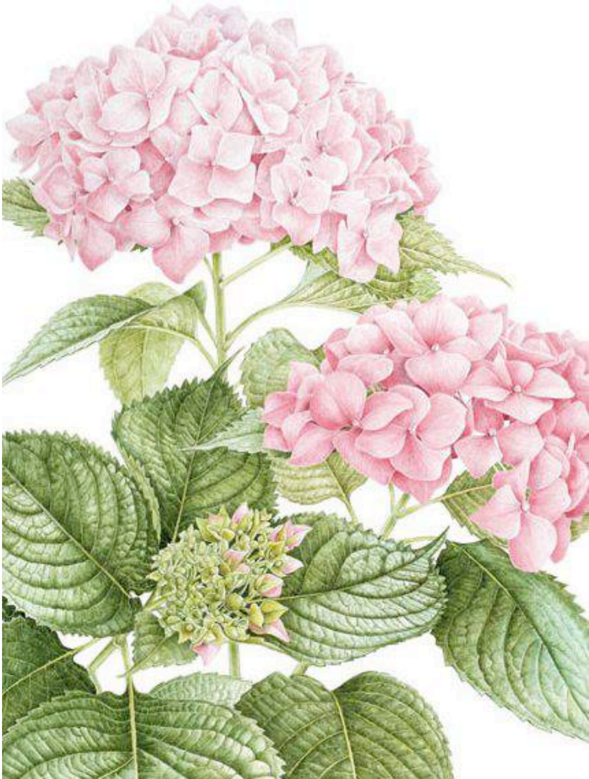
Hydrangea macrophylla